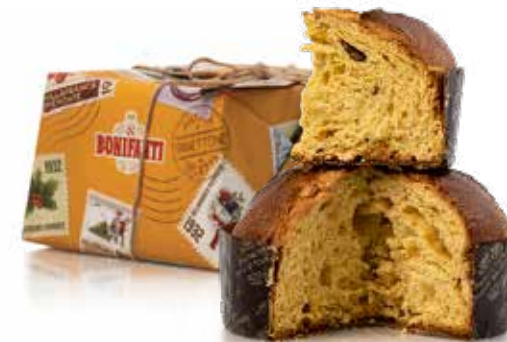
Bonifanti Chestnut Panettone

DISCOVER MORE THAN 30 FLAVORS THIS HOLIDAY SEASON AT EATALY.COM !