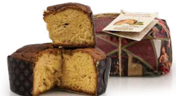
Fraccaro Treviso Wine Panettone