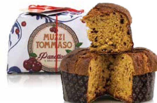
Muzzi Cherry Panettone