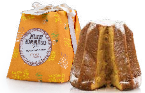
Muzzi Limoncello Pandoro