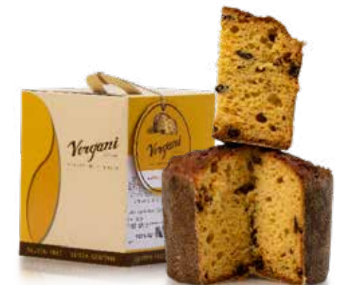
Vergani Vegan Holiday Cake