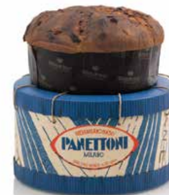
Brera Milano Classic Panettone